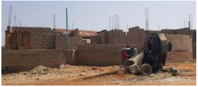
Construction work as at December 26, 2020